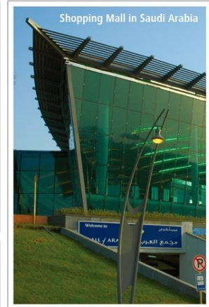
Shopping Mall in Saudi Arabia