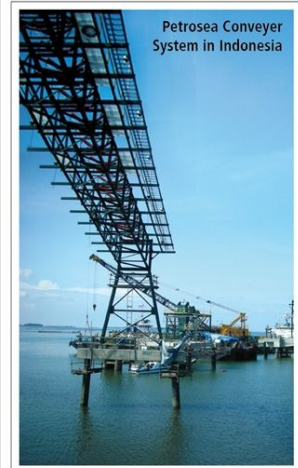
Petrosea Conveyor System in Indonesia