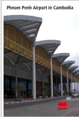
Phnom Penh Airport in Cambodia