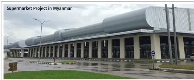
Supermarket Project in Myanmar

Join thousands of satisfied customers around the globe who have built with Zamil Steel. Make Zamil Steel your choice for your next building.