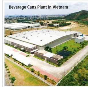
Beverage Cans Plant in Vietnam