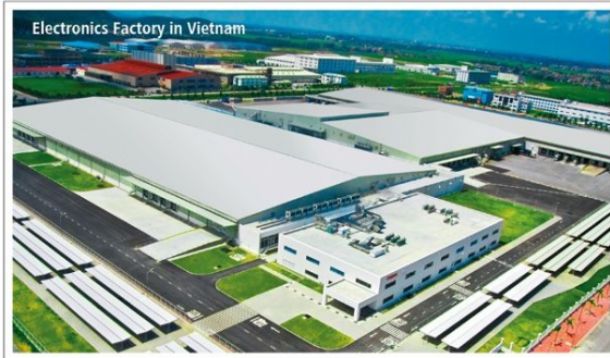
Electronics Factory in Vietnam