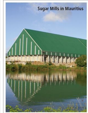
Sugar Mills in Mauritius