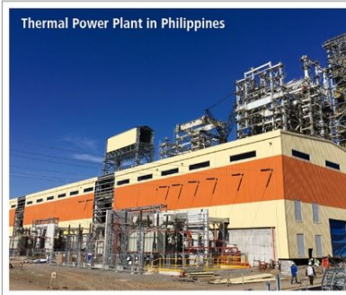
Thermal Power Plant in Philippines