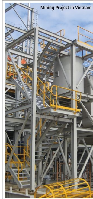
Mining Project in Vietnam