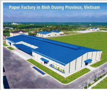
Paper Factory in Binh Duong Province, Vietnam